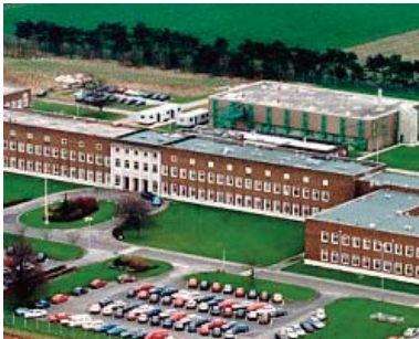
Porton Down Labs

Air Steril units will kill harmful airborne and surface viruses including Rhinovirus (Common Cold), Norovirus (Gastroenteritis) and Influenza. Even antibiotic resistant surface pathogens such as MRSA or C difficile are killed in all indoor areas.